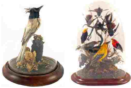
Lots 380 and 381