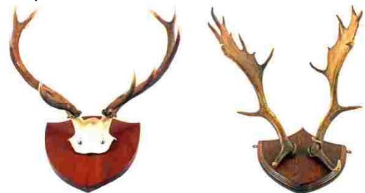
Lots 191 and 192