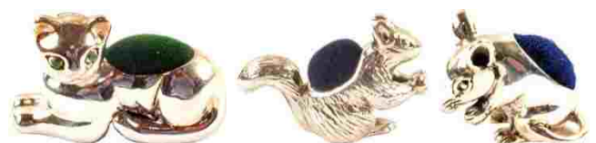
Lot 301H, 301K and 301L