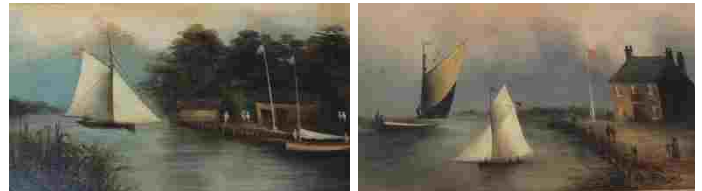
Lots 122 and 123